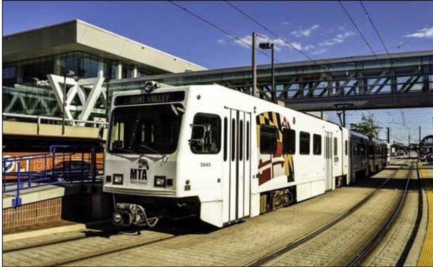
A Maryland Transit Administration light rail car stops in downtown Baltimore.