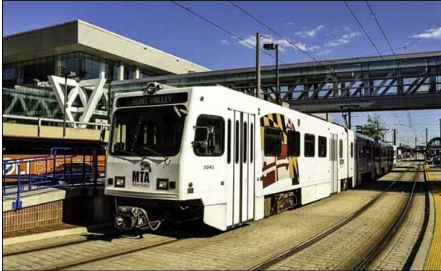
A Maryland Transit Administration light rail car stops in downtown Baltimore.