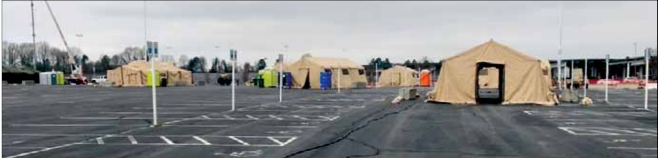
Prince George's County pilots a Mass Testing Site in March 2020