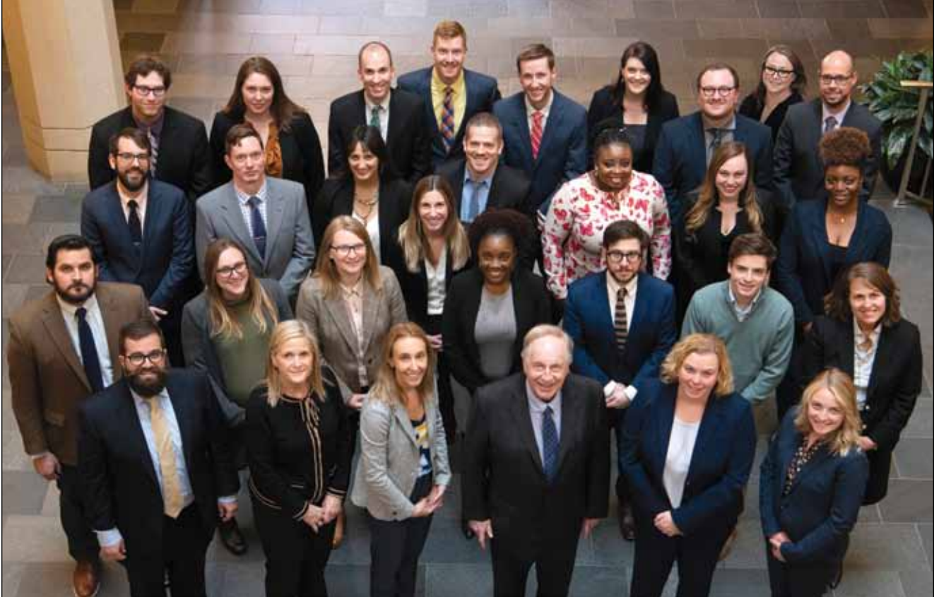
CHHS staff gather for our last in-person meeting, pre-pandemic shutdowns, in February 2020.