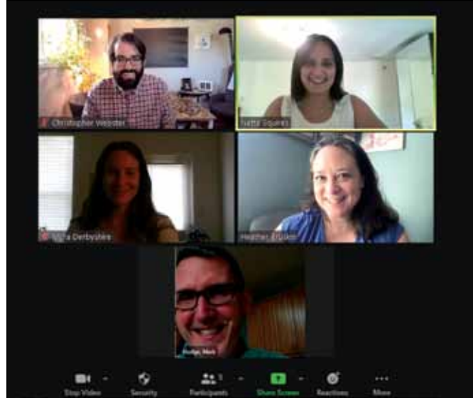
Montgomery County Food Security Task Force leadership meet virtually as part of the County's response to the food access crisis triggered by the pandemic.

The COVID-19 pandemic, and subsequent economic crisis, triggered a global food access crisis. In Montgomery County, Maryland, like many other localities across the country, the pandemic deepened inequities, increasing unemployment and health disparities. Montgomery County's existing decentralized food security network struggled to meet the rapidly expanding need. Growing lines for food support, emptying food pantry shelves, and disruptions in the "just in time" food supply chain, presented unique challenges to local emergency managers. The food security crisis disproportionately impacted minority and immigrant communities, raising important issues of equity and social justice in preparedness, response, and recovery.